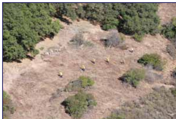
Krotona Hill Project

on top of the hill were protected by the required 100 feet of clearance, but the fuel load was so heavy further down the hill that an advancing fire would certainly overrun the abated area.