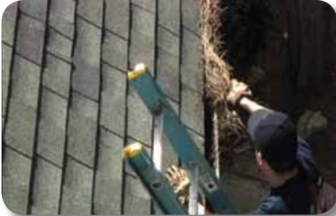
Clear leaves and debris from gutters and check your roof for leaks.

The most effective way to protect your property against flooding is to prepare before it rains. Preparations can consist of very simple home maintenance but, depending on your circumstances, may involve the construction of permanent drainage systems, walls or other measures to divert water, mud or debris.