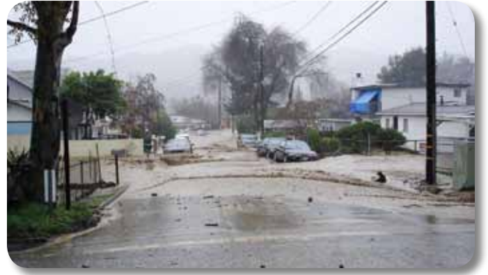
Do not attempt to walk, swim or drive through moving water or flooded areas.