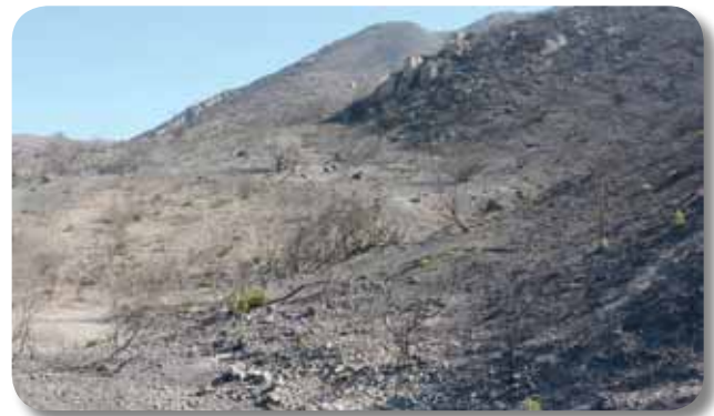
After a fire, vegetation that normally absorbs water is gone. Ash and debris can wash down and clog drainages causing flooding in areas below the fire.

landscaped areas, property owners may replace vegetation with appropriate fire-resistant, non-invasive plants. A local landscape professional can make recommendations for your particular area.