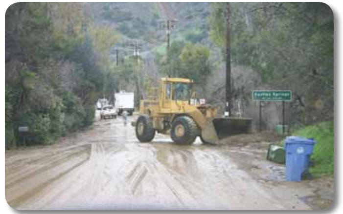
Do not enter a flooded area until it is safe to do so. Flooding can wash out or undermine roads.