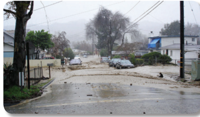
Do not attempt to walk, swim or drive through moving water or flooded areas.