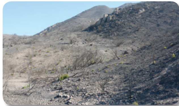
After a fire, vegetation that normally absorbs water is gone. Ash and debris can wash down and clog drainages causing flooding in areas below the fire.

landscaped areas, property owners may replace vegetation with appropriate fire-resistant, non-invasive plants. A local landscape professional can make recommendations for your particular area.