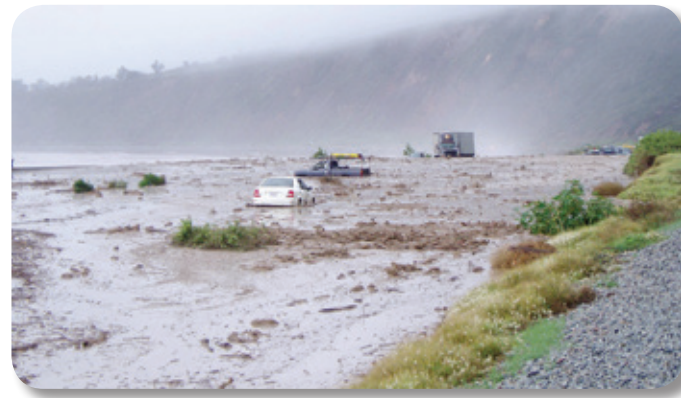
Two feet of water is enough to wash away a passenger vehicle.