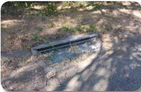
Leaves and debris can clog drains and cause flooding. Clear drain areas around your home before the rain starts. Check curbside gutters and drains and, if they are clogged, alert local officials or other responsible parties.