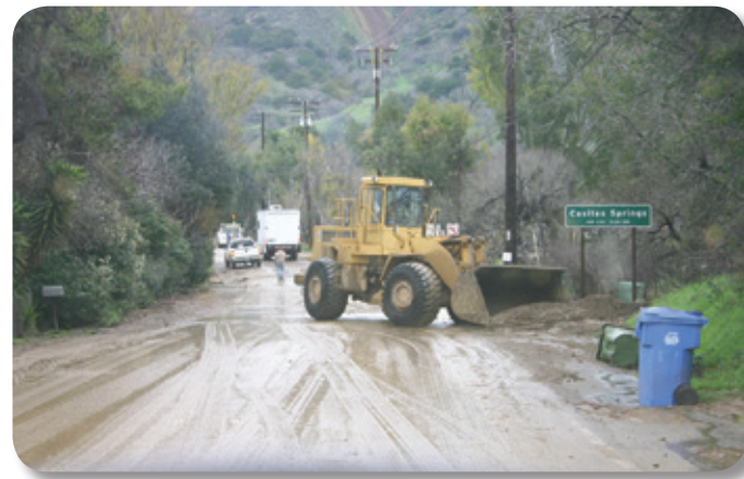
Do not enter a flooded area until it is safe to do so. Flooding can wash out or undermine roads.