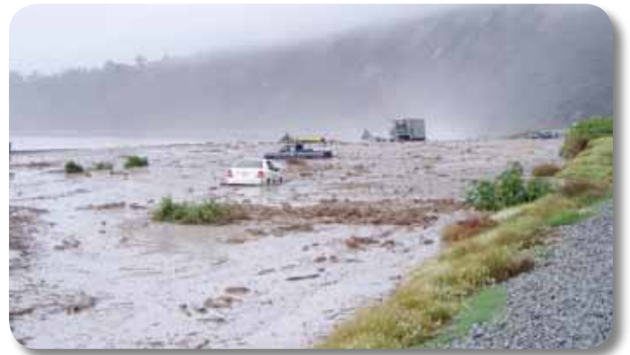
Two feet of water is enough to wash away a passenger vehicle.