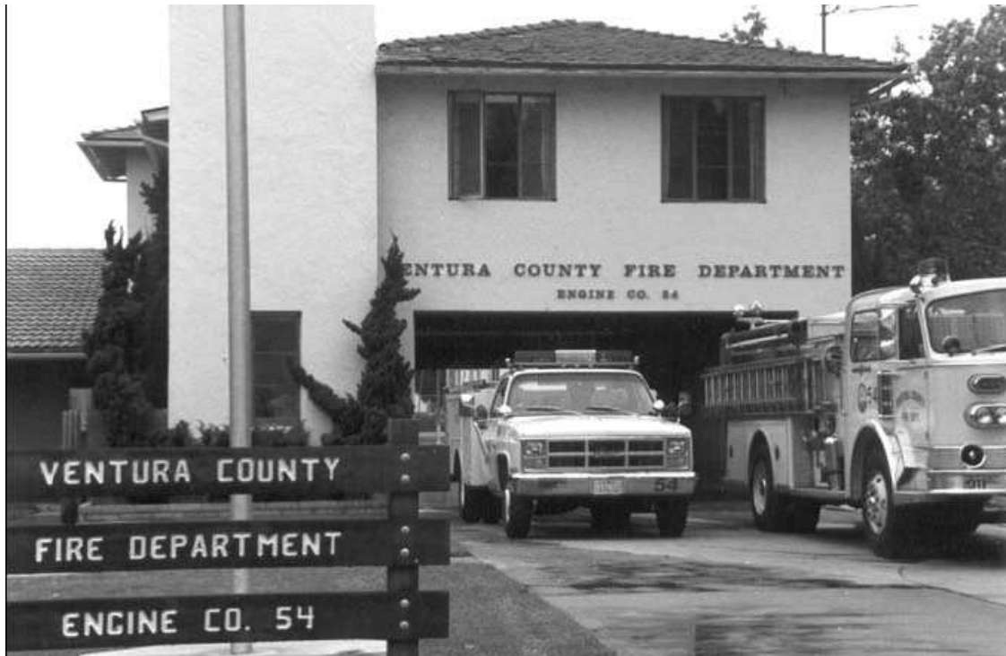
Old Fire Station 54 on Ventura Boulevard.

In 1954, the County Fire Chief organized the department into four battalions with assigned numbers. Camarillo was in Battalion 3 along with Station 31 in Thousand Oaks, Lake Sherwood was Station 33, and Camarillo was Station 32. Station 32 changed to Station 54 when Battalion 5 was formed in the late 1950s.