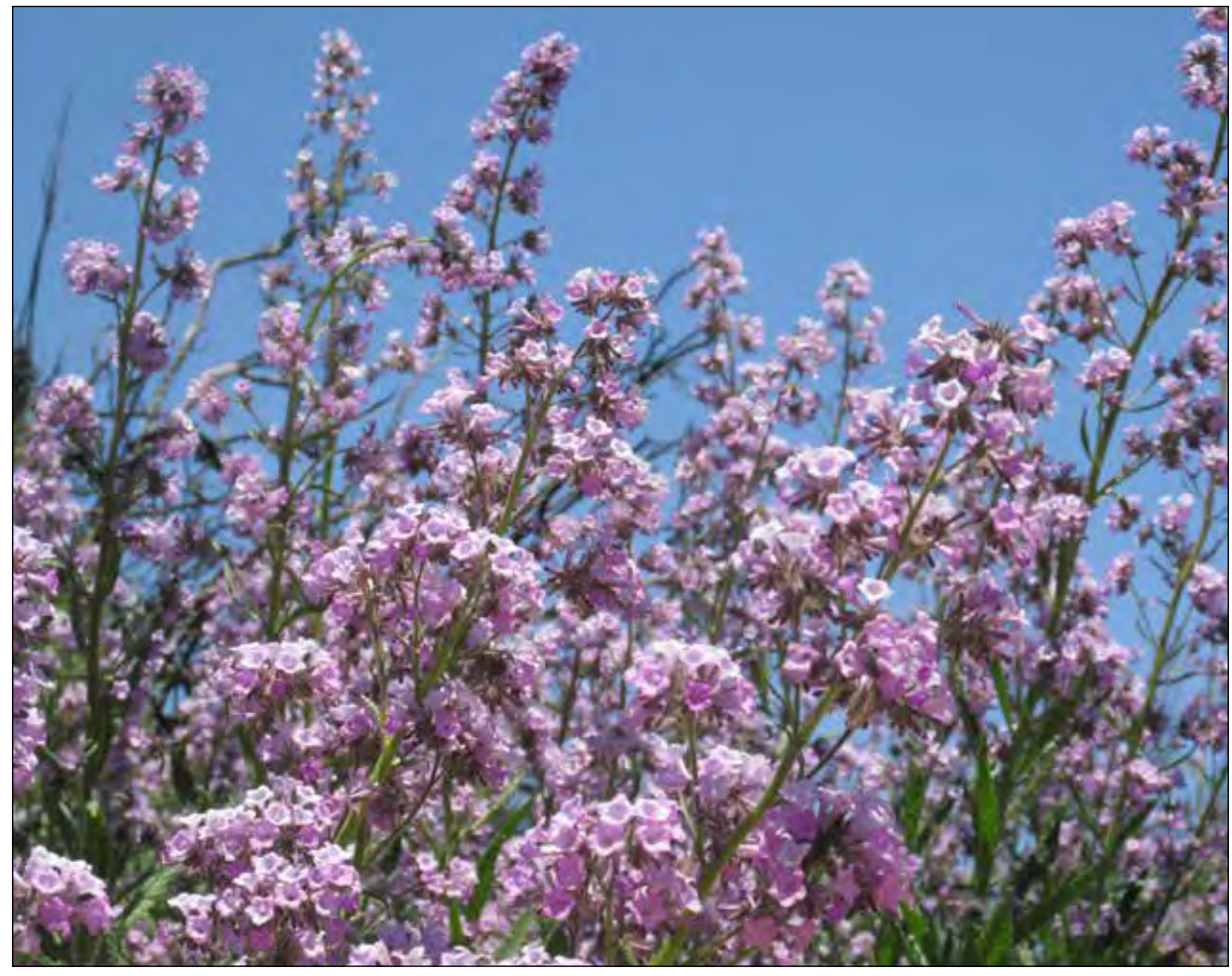
Ojai Valley News Photo by Perry Van Houten

Stay as far away as possible from the poodle-dog bush.